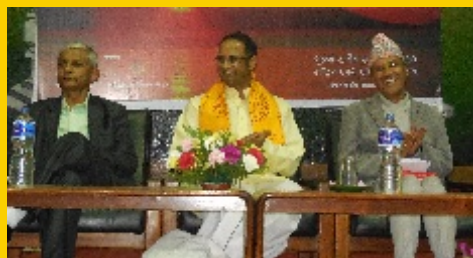
Workshop on Human Excellence