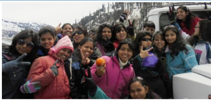
The final year students of Department of Psychology