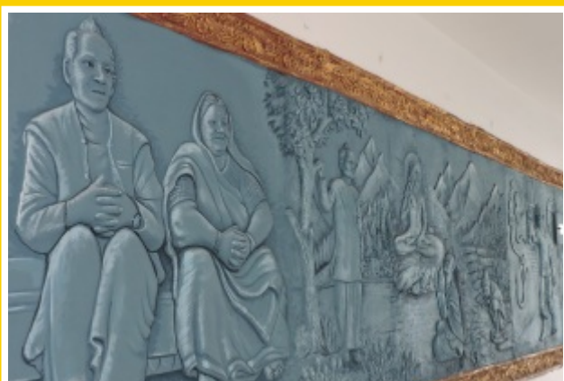
Murals exhibition at Mritunjay Auditorium depicting the life events of Pt. Shriram Sharma Acharya