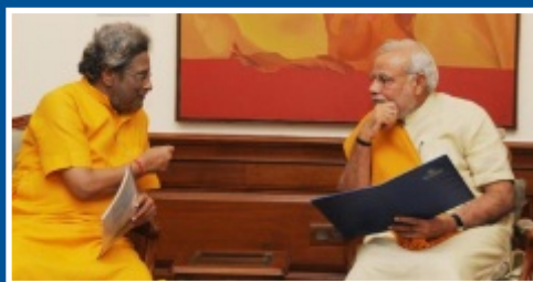
Hon. Chancellor meeting Hon. Prime Minister of India