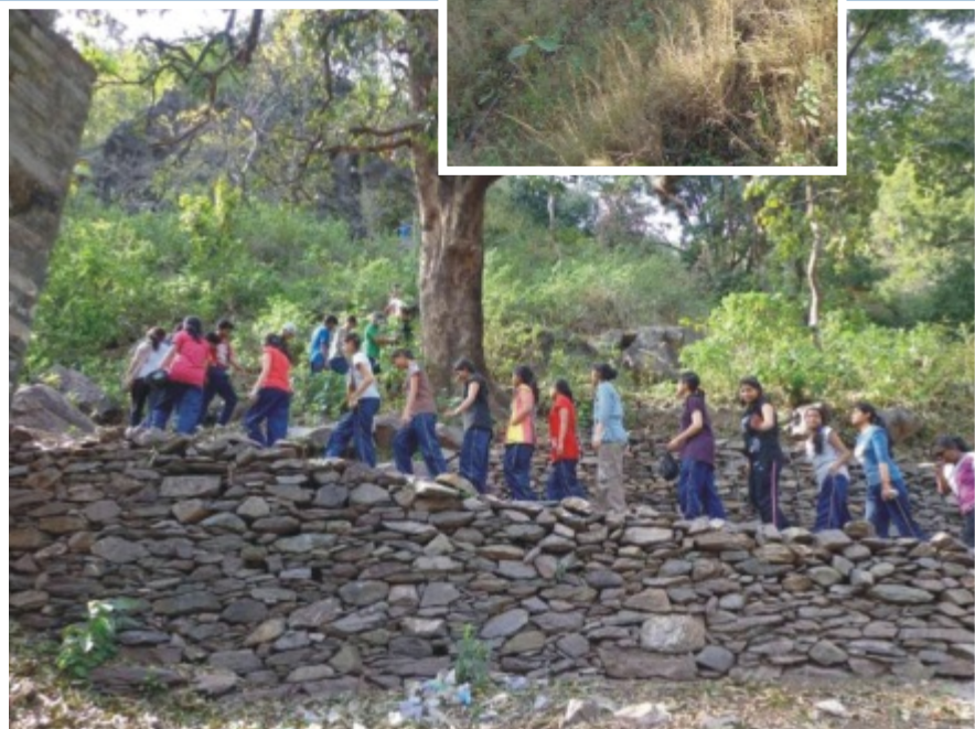
Trekking camp by Department of Tourism