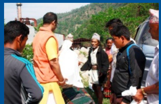
Earth quake relief by awgp