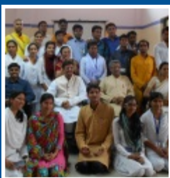
Workshop on mind energy & soul