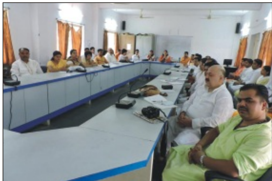
Participant from DSVV and Garwal University

Workshop was organised with the collaboration of DSVV, PUSA New Delhi, Incredible India and NSS and Garwal University. Theme of the workshop was 'Ancient Vedic Culture' in the perspective of skill development in Tourism & Hospitality.