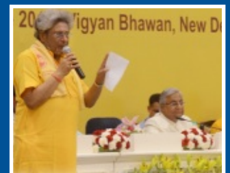
International Conference on Yoga