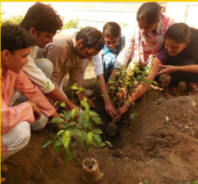
Students encouraging tree plantation