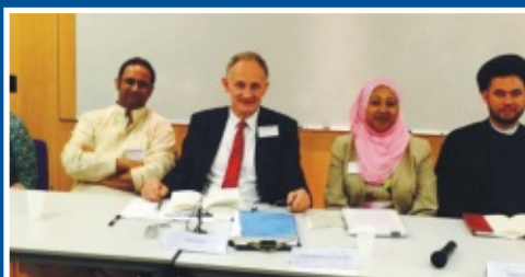
Global peace and harmony Seminar at Cambridge