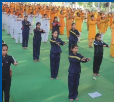
Students of DSVV, Administration, faculty members, volunteers of shantikunj participating at Shantikunj