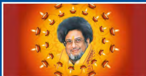
Chetna Diwas Birth Ceremony of Shradhdey Dr. Pranav Pandya Ji