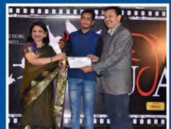
Students of JMC, DSVV bagged awards at Chitkara University