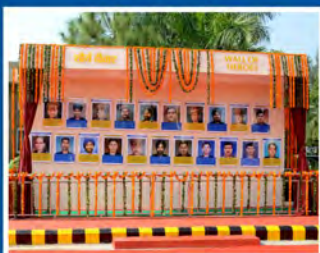
Unveiling of 'Wall of Heroes'